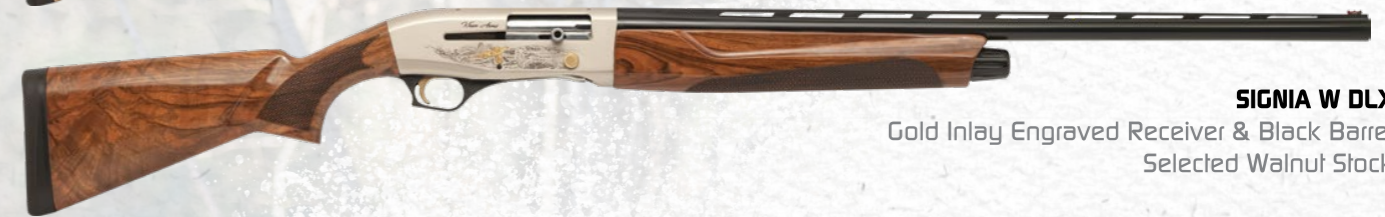
SIGNIA W DLX Gold Inlay Engraved Receiver & Black Barrel Selected Walnut Stock