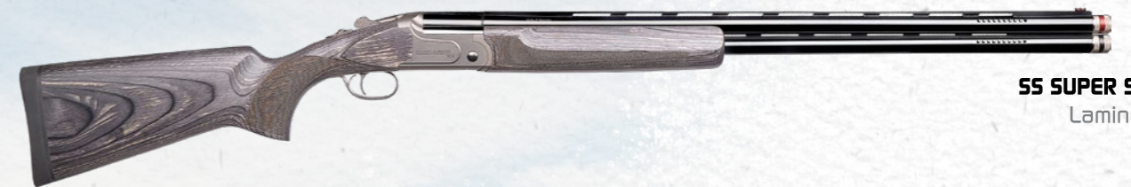
SS SUPER SPORTING Laminate Stock

K-005 is at the top of the line, delivering performance in elegance;