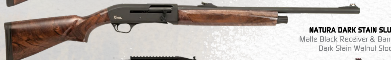
NATURA DARK STAIN SLUG Malte Black Receiver & Barrel Dark Stain Walnut Stock