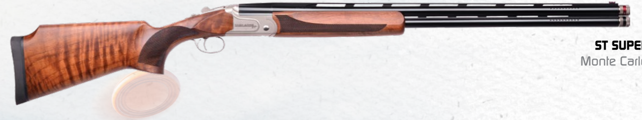
ST SUPER TRAP Monte Carlo Stock