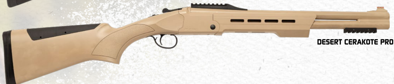
DESERT CERAKOTE PRO

An easy to operate over&under shotgun with a short barrel equipped with picatinny rails and fiber optic front sights.