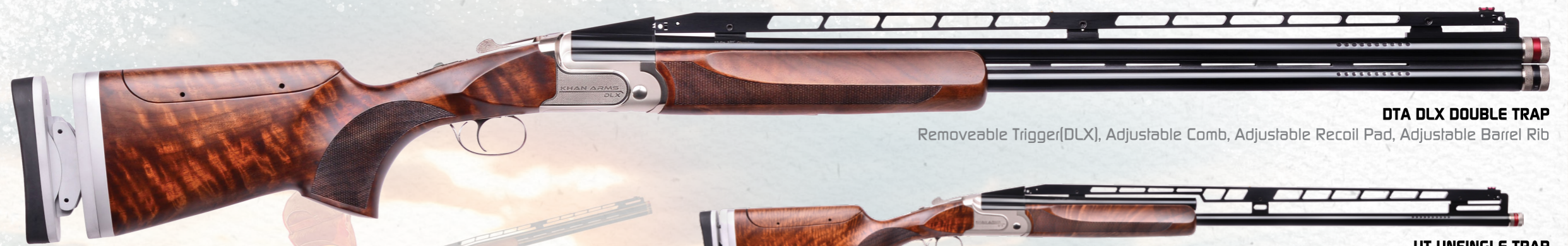
DTA DLX DOUBLE TRAP

Removeable Trigger(DLX), Adjustable Comb, Adjustable Recoil Pad, Adjustable Barrel Rib