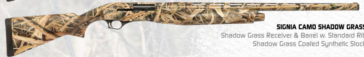
SIGNIA CAMO SHADOW GRASS Shadow Grass Receiver & Barrel w. Standard Rib Shadow Grass Coated Synthetic Stock