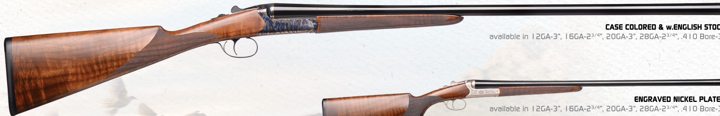
CASE COLORED & w. ENGLISH STOCK available in 12GA-3", 16GA-2 3 / 4 ", 20GA-3", 28GA-2 3 / 4 ", .410 Bore-3"