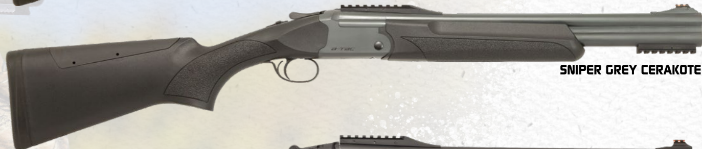
SNIPER GREY CERAKOTE