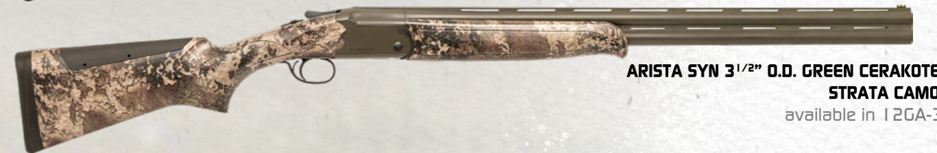
ARISTA SYN 3 1/2" O.D. GREEN CERAKOTE® STRATA CAMO® available in 12GA-3"