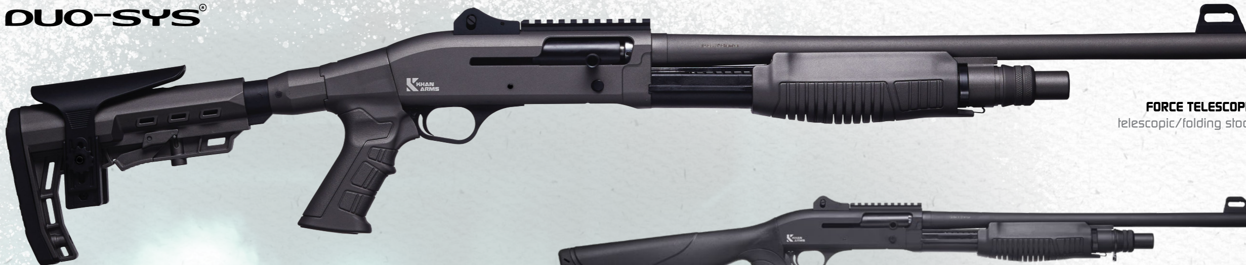
FORCE TELESCOPIC telescopic/folding stock