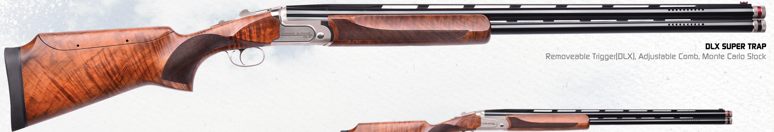
DLX SUPER TRAP Removeable Trigger(DLX), Adjustable Comb, Monte Carlo Stock