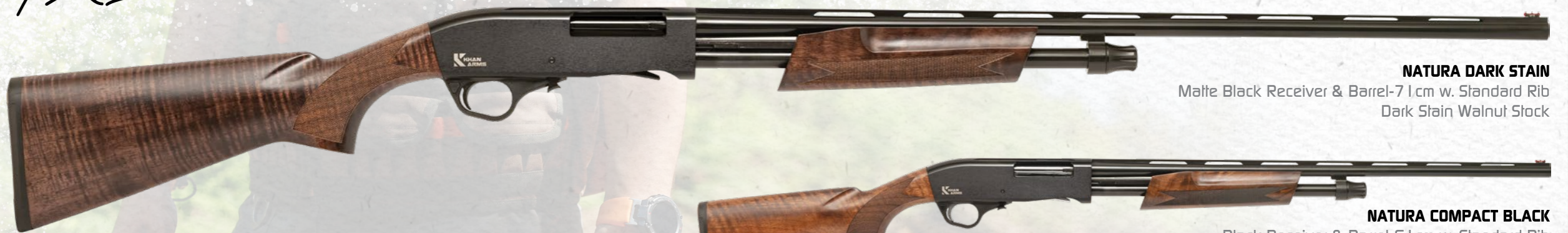
NATURA DARK STAIN Matte Black Receiver & Barrel-71 cm w. Standard Rib Dark Stain Walnut Stock