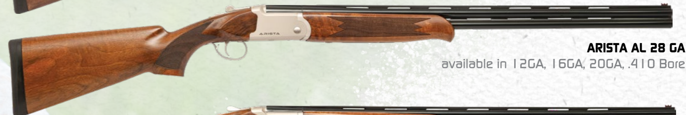
ARISTA AL 28 GA available in 12GA, 16GA, 20GA, .410 Bore