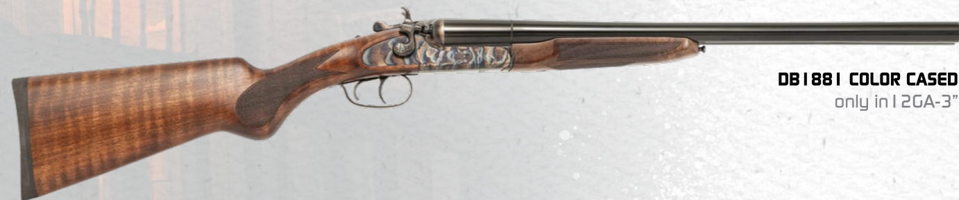
DB1881 COLOR CASED only in 12GA-3"