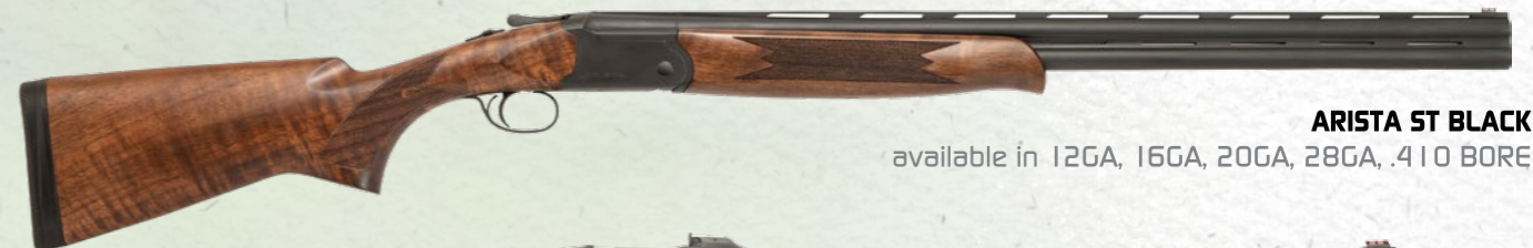
ARISTA ST BLACK available in 12GA, 16GA, 20GA, 28GA, .410 BORE