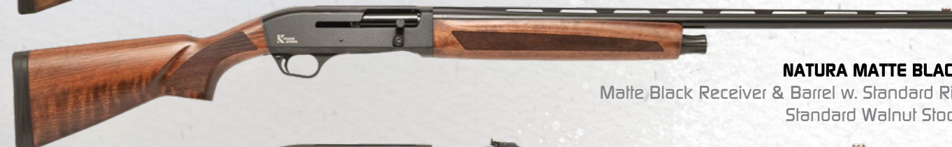
NATURA MATTE BLACK Malte Black Receiver & Barrel w. Standard Rib Standard Walnut Stock