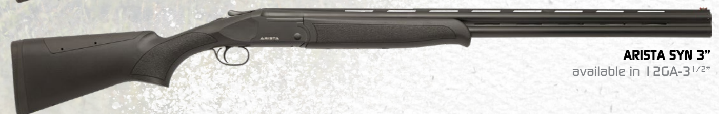
ARISTA SYN 3" available in 12GA-3 1/2"

ARISTA line of products offer you simplicity and functionality;