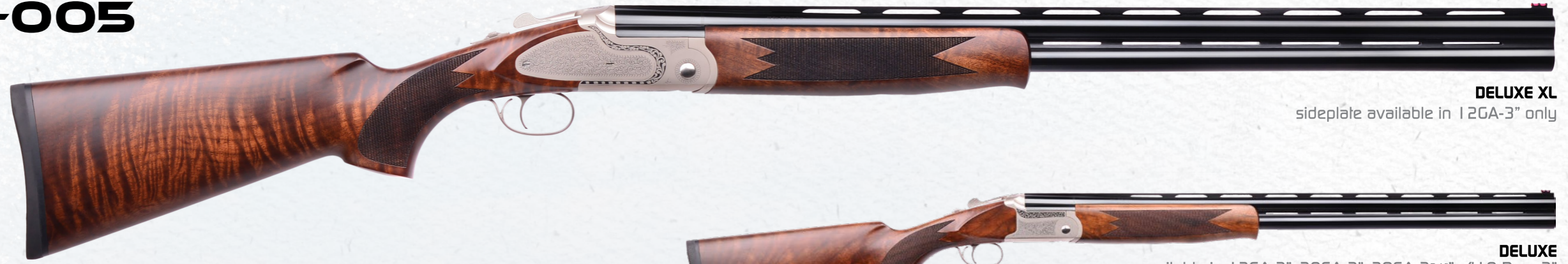
DELUXE XL sideplate available in 12GA-3" only