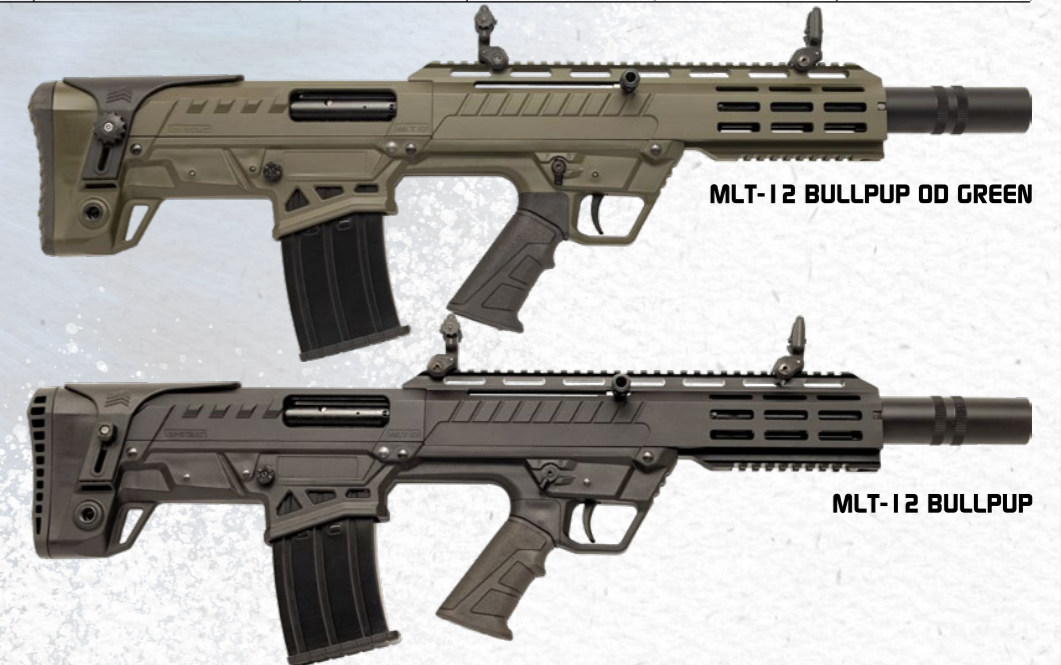
MLT-12 BULLPUP OD GREEN