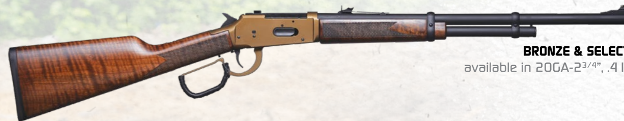
BRONZE & SELECTED WALNUT available in 20GA-2 3/4", .410 Bore-2 1/2"