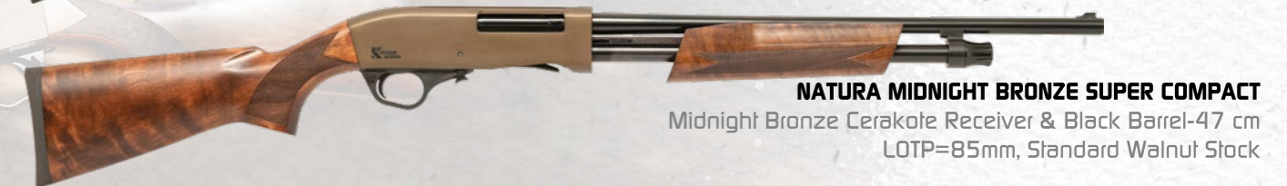
NATURA MIDNIGHT BRONZE SUPER COMPACT Midnight Bronze Cerakote Receiver & Black Barrel-47 cm LOTP=85mm, Standard Walnut Stock