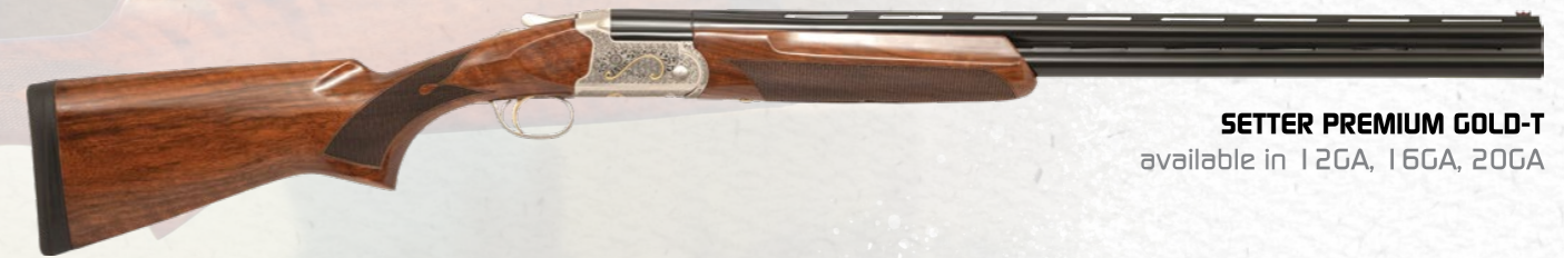
SETTER PREMIUM GOLD-T available in 12GA, 16GA, 20GA

They all feature a Single Selective Trigger and an LPA® Fiber Optic Bar Front Sight. 'Length of Pull' 'Trigger Pull Weight' & 'Forend Latch Tightness' can be adjusted/customized.