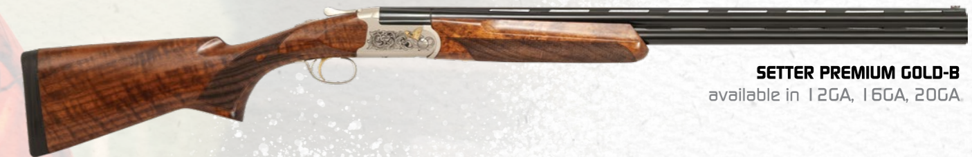
SETTER PREMIUM GOLD-B available in 12GA, 16GA, 20GA