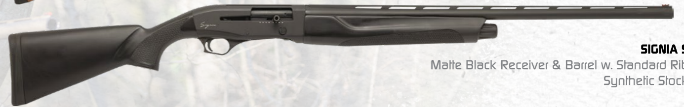
SIGNIA S Matte Black Receiver & Barrel w. Standard Rib Synthetic Stock