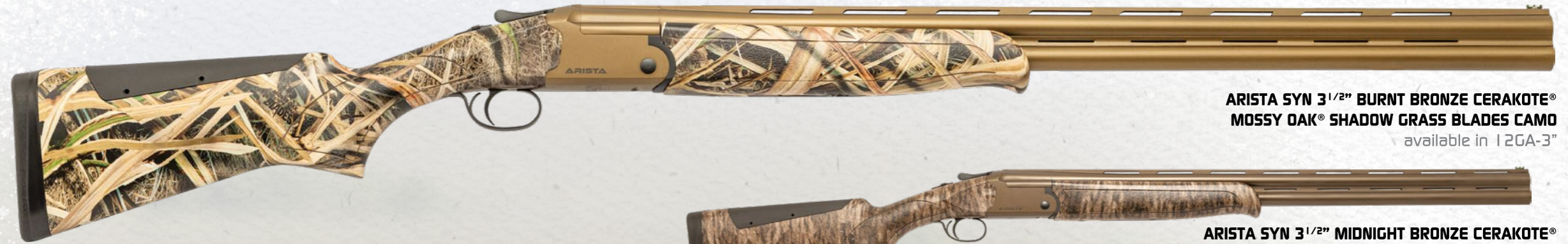
ARISTA SYN 3 1/2" BURNT BRONZE CERAKOTE® MOSSY OAK® SHADOW GRASS BLADES CAMO available in 12GA-3"