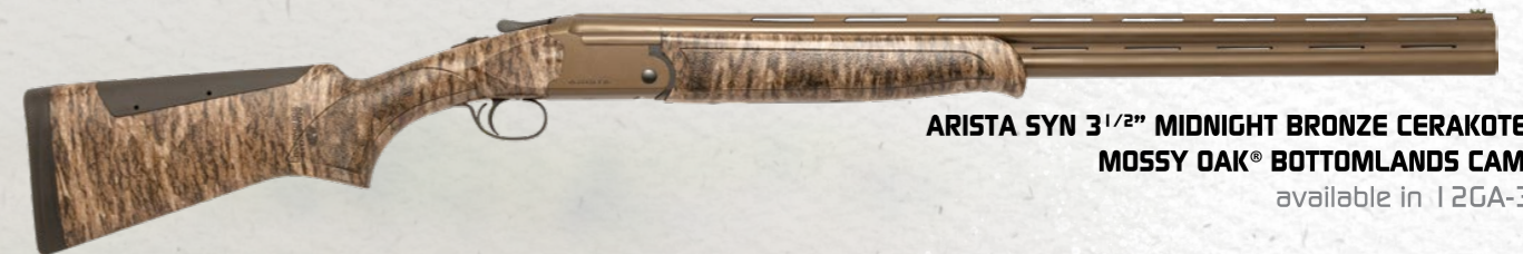
ARISTA SYN 3 1/2" MIDNIGHT BRONZE CERAKOTE® MOSSY OAK® BOTTOMLANDS CAMO available in 12GA-3"