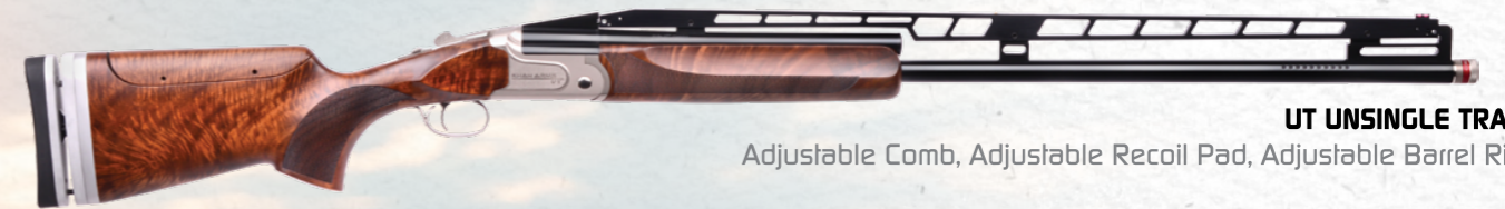
UT UNSINGLE TRAP

Removeable Trigger(DLX), Adjustable Comb, Adjustable Recoil Pad, Adjustable Barrel Rib