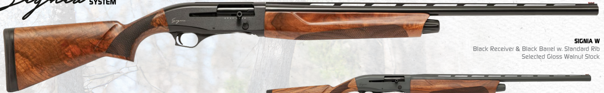
SIGNIA W Black Receiver & Black Barrel w. Standard Rib Selected Gloss Walnut Stock