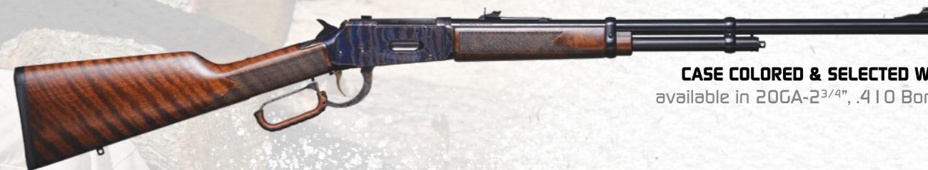
CASE COLORED & SELECTED WALNUT available in 20GA-2 3/4", .410 Bore-2 1/2"