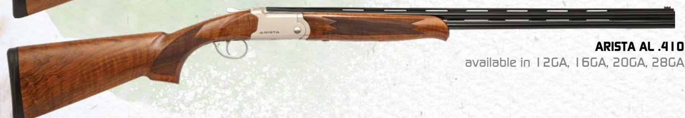
ARISTA AL .410 available in 12GA, 16GA, 20GA, 28GA

ARISTA line of products offer you simplicity, functionality;