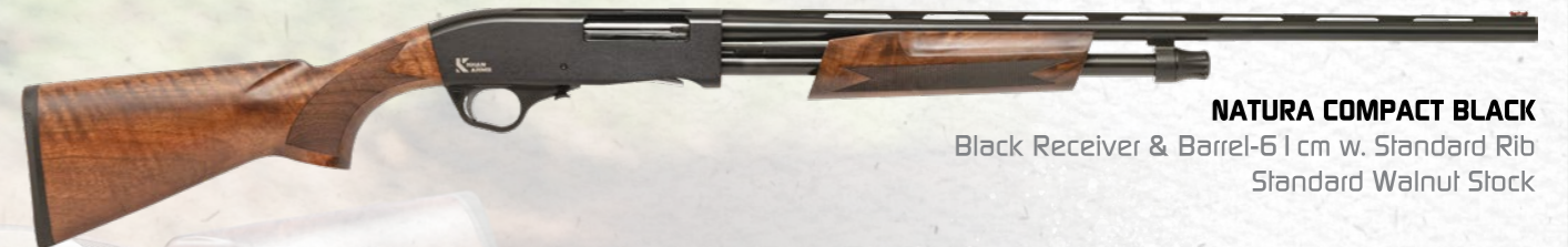
NATURA COMPACT BLACK Black Receiver & Barrel-61 cm w. Standard Rib Standard Walnut Stock