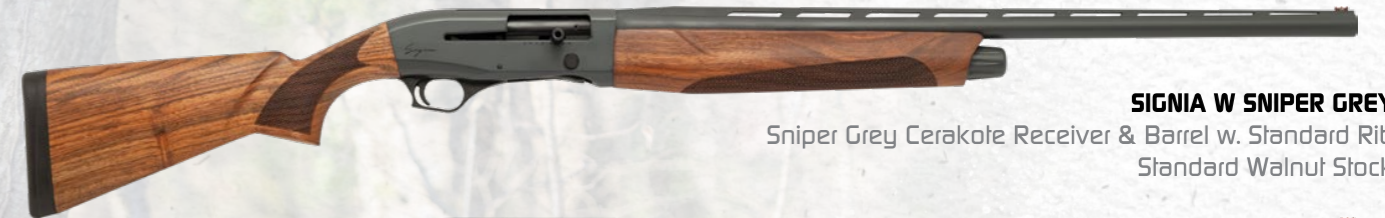
SIGNIA W SNIPER GREY Sniper Grey Cerakote Receiver & Barrel w. Standard Rib Standard Walnut Stock