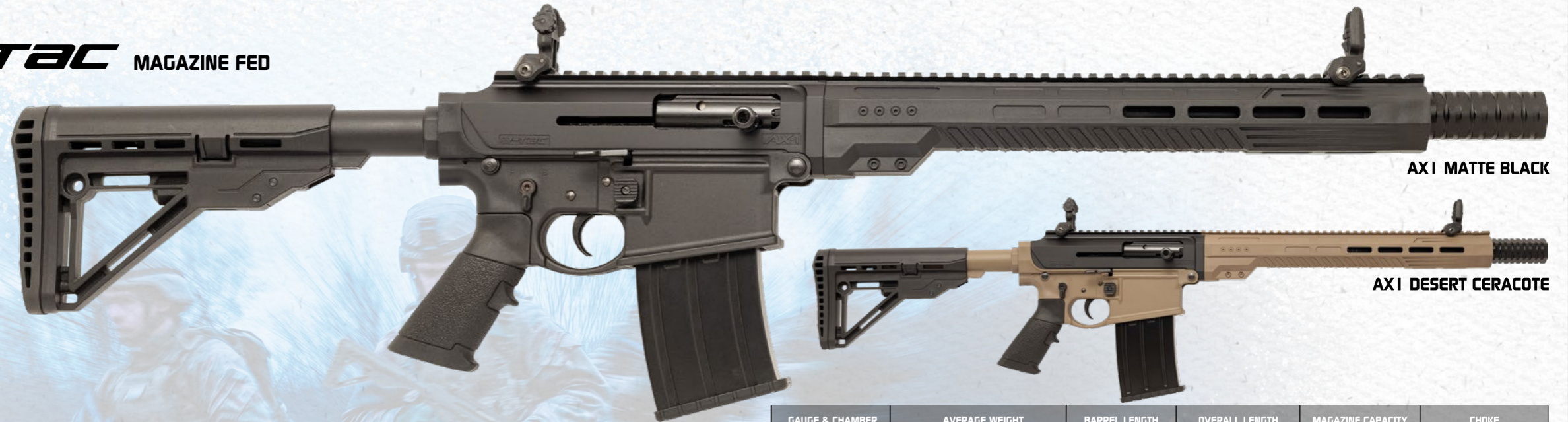
AX1 MATTE BLACK