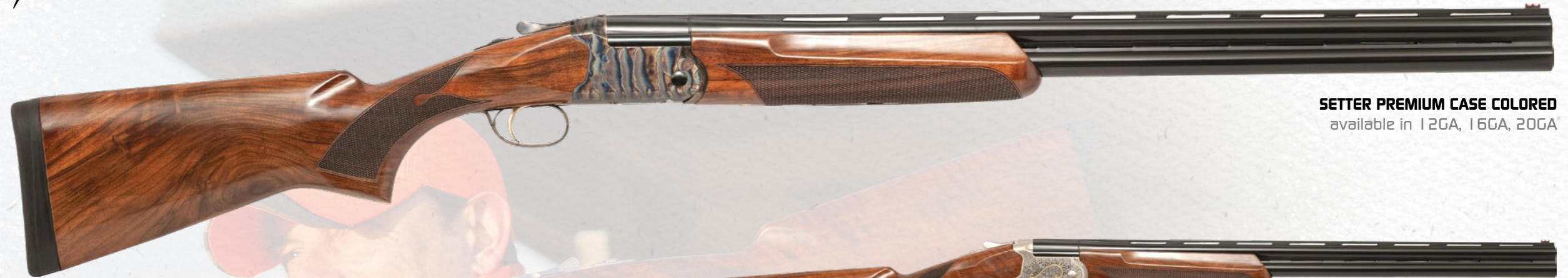
SETTER PREMIUM CASE COLORED available in 12GA, 16GA, 20GA

Here are the 'New Classics' from Khan Arms !