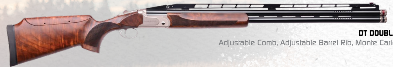
DT DOUBLE TRAP

Adjustable Comb, Adjustable Recoil Pad, Adjustable Barrel Rib