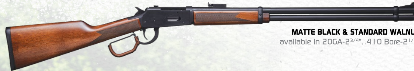
MATTE BLACK & STANDARD WALNUT available in 20GA-2 3/4", .410 Bore-2 1/2"