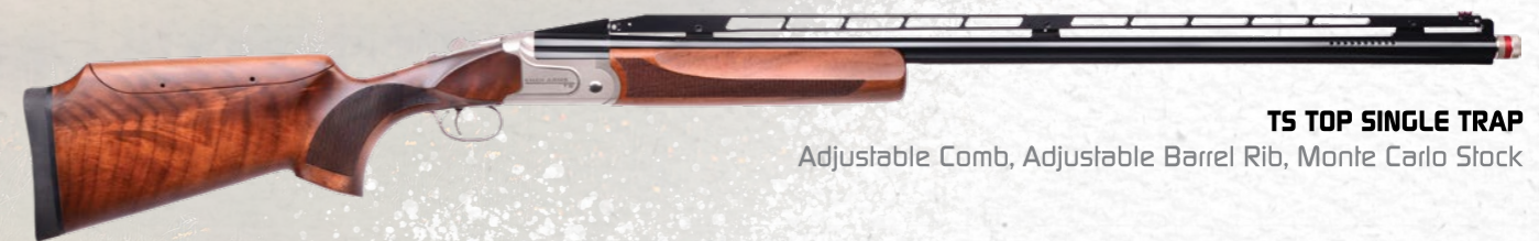
TS TOP SINGLE TRAP

Adjustable Comb, Adjustable Barrel Rib, Monte Carlo Stock