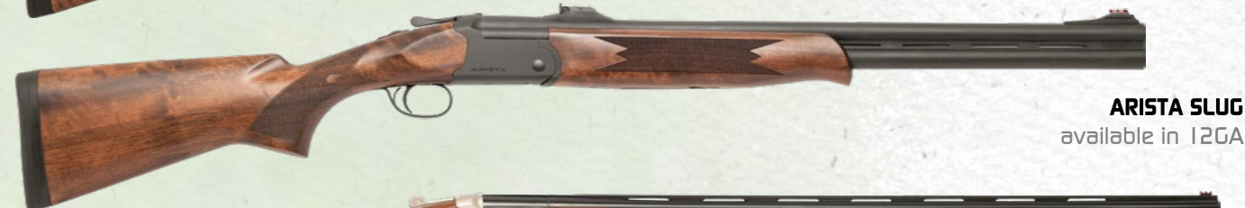
ARISTA SLUG available in 12GA