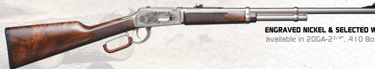
ENGRAVED NICKEL & SELECTED WALNUT available in 20GA-2 3/4", .410 Bore-2 1/2"