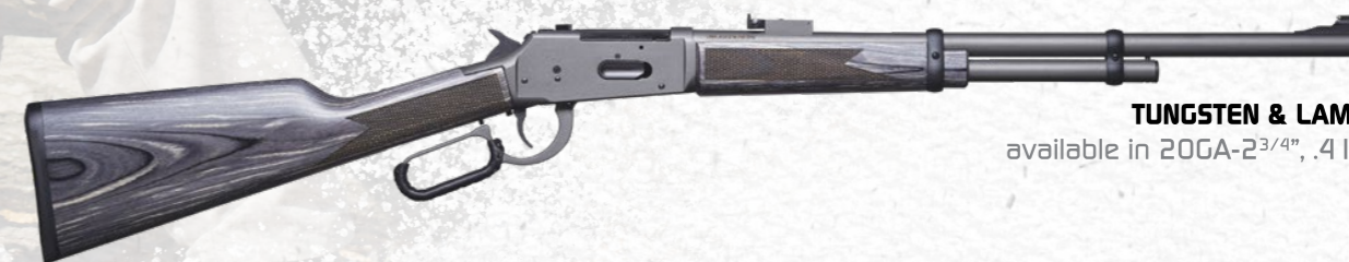
TUNGSTEN & LAMINATE WOOD available in 20GA-2 3/4", .410 Bore-2 1/2"