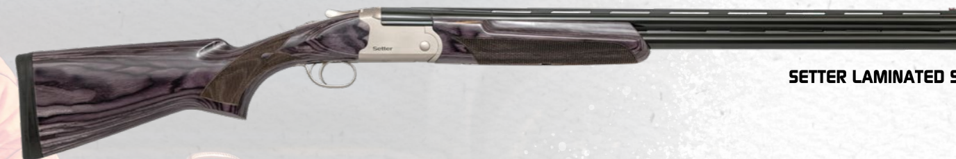
SETTER LAMINATED ST