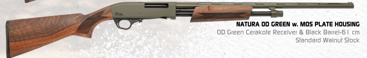
NATURA OD GREEN w. MOS PLATE HOUSING OD Green Cerakote Receiver & Black Barrel-61 cm Standard Walnut Stock

PXS is the petite and elegant pump-action shotgun line built on a true .410 frame by Khan Arms.