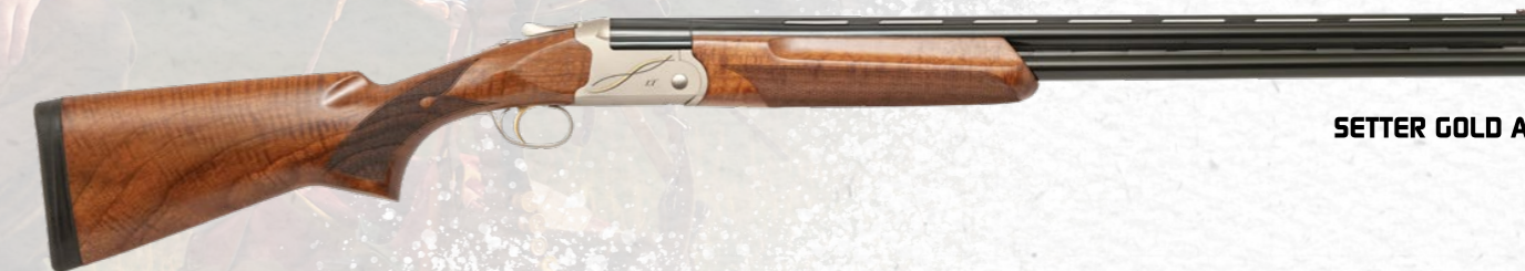
SETTER GOLD AL

SETTER Aluminum or Steel receiver models feature an ultra light alloy or steel receiver with modern lines and laser engravings. SETTER has a sporty design barrel rib and a top lever, along with fine standard Turkish walnut stocks. It comes with fully rounded checkered forend anti-slip & machined fit microsystem recoil pad.