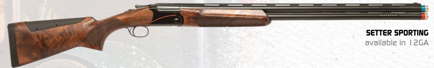
SETTER SPORTING available in 12GA

Ported barrel is optional on this model.