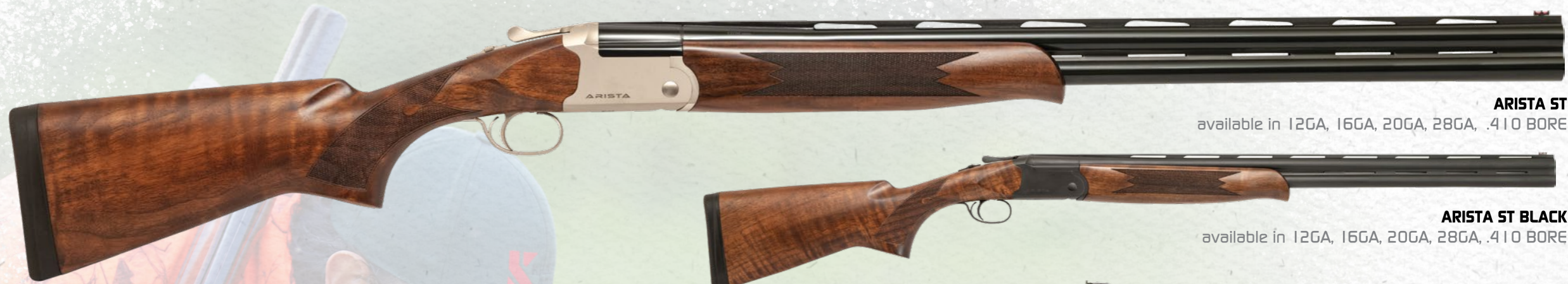
ARISTA ST available in 12GA, 16GA, 20GA, 28GA, .410 BORE