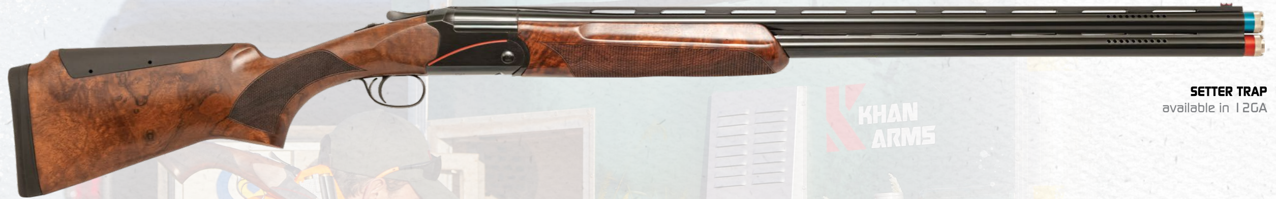
SETTER TRAP available in 12GA

SETTER SPORTING models feature a durable steel receiver with modern lines and laser engraving.