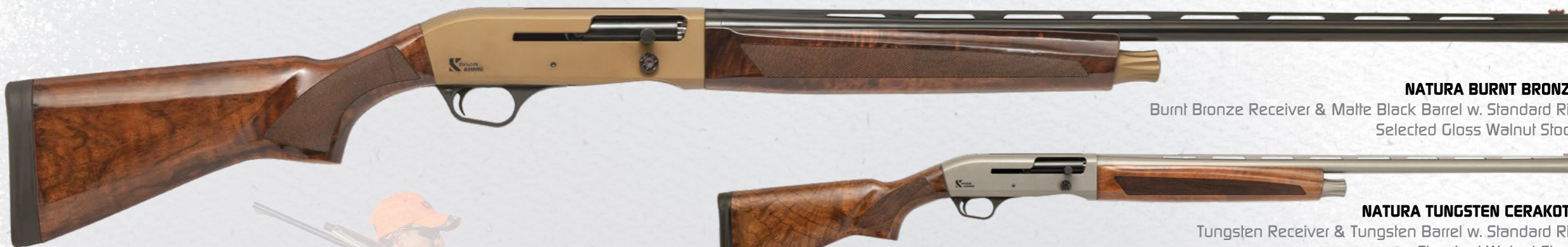
NATURA BURNT BRONZE Burnt Bronze Receiver & Malte Black Barrel w. Standard Rib Selected Gloss Walnut Stock