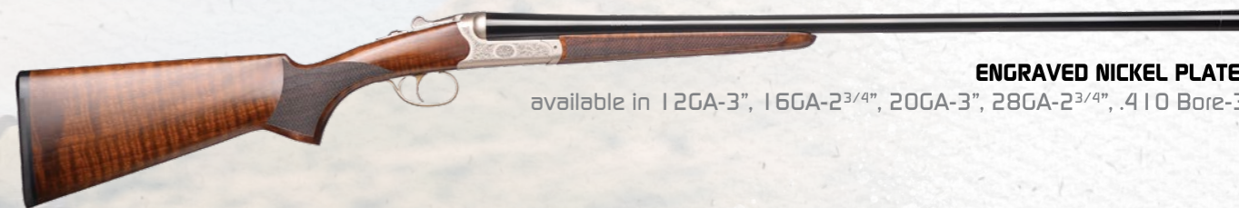
ENGRAVED NICKEL PLATED available in 12GA-3", 16GA-2 3 / 4 ", 20GA-3", 28GA-2 3 / 4 ", .410 Bore-3"