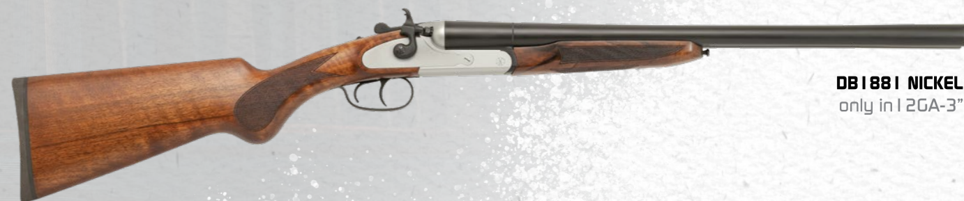
DB1881 NICKEL only in 12GA-3"

Classic Exposed Hammer Coach Gun: Your Trusted Companion for Home Defense and Cowboy Action.