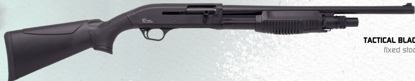
TACTICAL BLACK fixed stock

DUO-SYS offers the option of converting between Semi-Auto / Pump-Action operation modes in a matter of seconds.