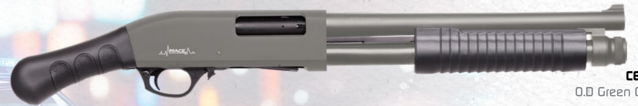
CERAKOTE O.D Green Cerakote