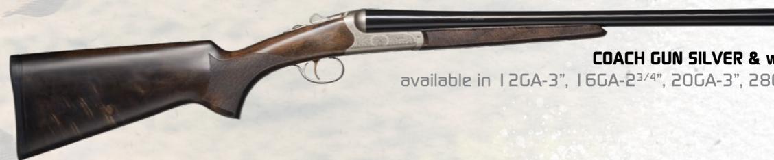
COACH GUN SILVER & w. DARK STAIN WALNUT available in 12GA-3", 16GA-2 3 / 4 ", 20GA-3", 28GA-2 3 / 4 ", .410 Bore-3"