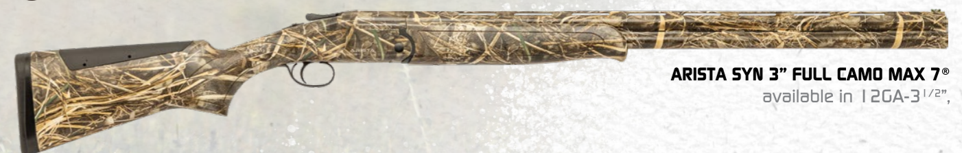
ARISTA SYN 3" FULL CAMO MAX 7® available in 12GA-3 1/2",