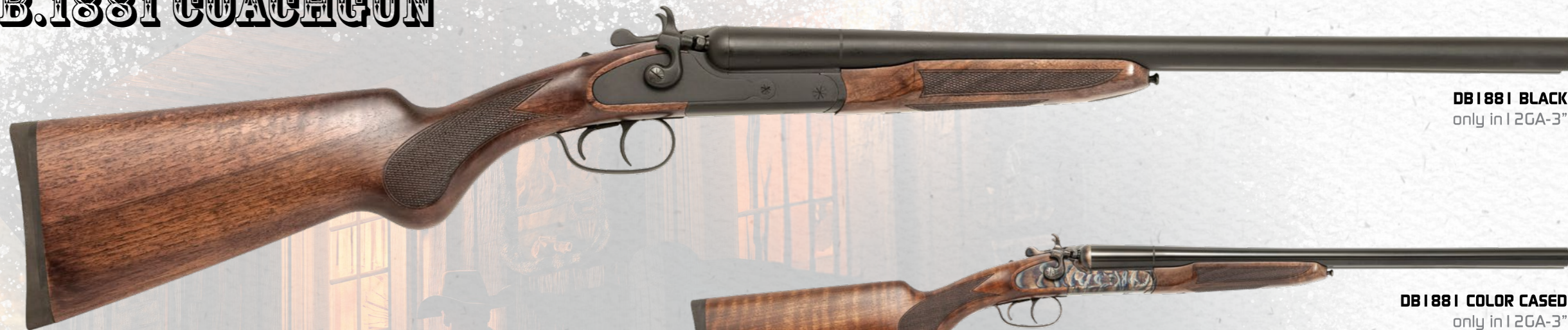
DB1881 BLACK only in 12GA-3"