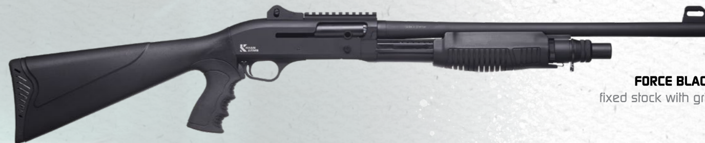
FORCE BLACK fixed stock with grip