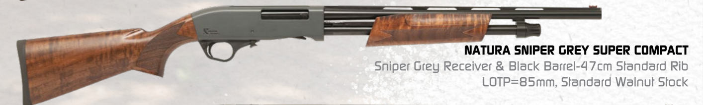
NATURA SNIPER GREY SUPER COMPACT Sniper Grey Receiver & Black Barrel-47cm Standard Rib LOTP=85mm, Standard Walnut Stock