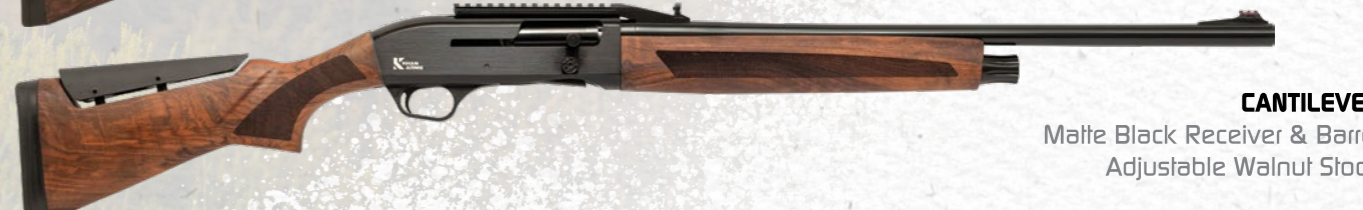
CANTILEVER Malte Black Receiver & Barrel Adjustable Walnut Stock

Khan Arms presents the ultimate inertia system semi-automatic shotgun!