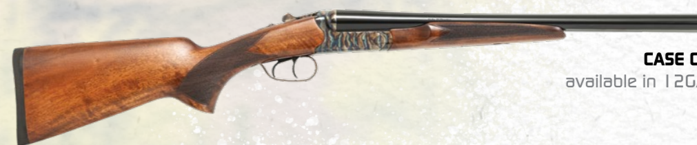
CASE COLORED & DOUBLE TRIGGER available in 12GA-3", 20GA-3", .410 Bore-3" LOP 360mm

K-005 is at the top of the line, delivering performance in elegance;